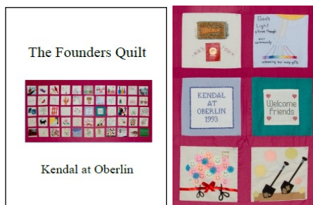
Book cover, front and back.

Each square depicts some aspect of the early days at Kendal.