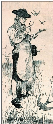
John Bartram (1699-1777), 19th Century illustration by Howard Pyle.