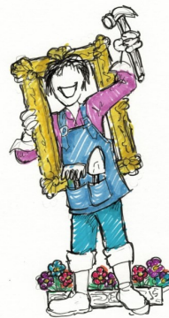
Val the Volunteer