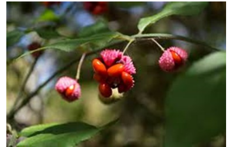
Spring green blossoms and fall red seeds of Euonymus americanus.