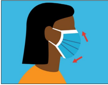
Make sure the mask covers your nose, mouth, and chin and fits snugly at top and bottom.