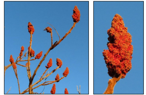
Closeups of staghorn sumac.

Horticulturist Rachel Duncan (who is also an ISA-certified arborist) are ready to work with a handful of residents to determine the best management plan regarding desirable trees, a sumac footprint, placement of bluebird boxes, etc.