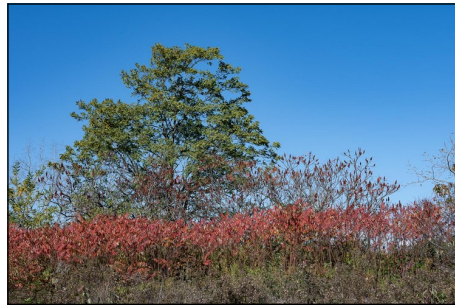
Staghorn sumac on Wildflower Hill in late fall.

But wild sumac can overgrow its place in the landscape, so it needs to be controlled. It spreads via a rhizome from which suckers are sent up. In a meadow there is a natural progression whereby woody species colonize and