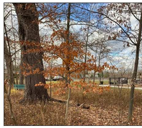
In the Woods at 4.

edges, and they are about 3 to 5 inches long. Dark green in spring and summer, the leaves turn a beautiful golden bronze in the fall and stay on the branches throughout the winter. The buds for next year's leaves are slender, pointed, and reddish-brown, hiding just above where last year's leaf is holding on to the branch. Sometimes small black spots caused by fungi occur on leaves; this might result in some defoliation.