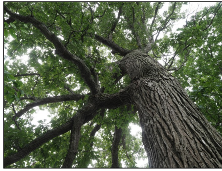
Historic Oak

Oaks are grouped into two types: the white and the red/black. White oaks