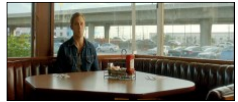
Solo Diners: Come fill our table!