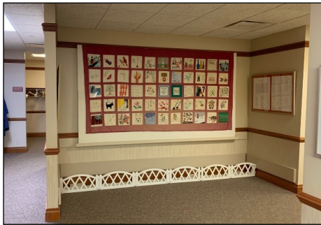
Come see the Founders Quilt in this small alcove between Heiser Lounge and The Penn.