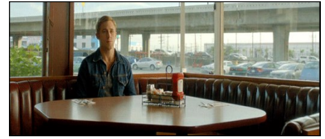
Solo Diners: Come fill our table!