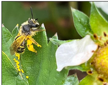
Solitary bee covered with pollen.

Ohio actually only has one species of hummingbird, the Ruby Throated Hummingbird. It prefers red flowers and is especially important for pollinat-