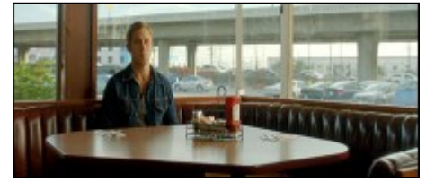
Solo Diners: Come fill our table!

We do simple sewing jobs for residents only. Bring your clean, bagged items to the Craft Room anytime, place them on the table, fill out the work order form. Or stop by during open hours.