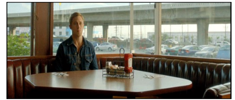
Solo Diners: Come fill our table!