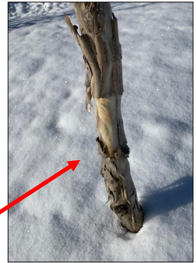
Seven Sons in winter pruned in three different ways and closeup of stem.