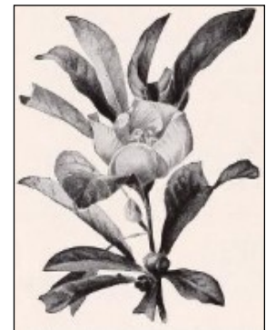
"The Most Interesting Tree in America" Ornamental Hardy Plants of the Better Class: Spring 1906 (Thomas Meehan & Sons, 1906), https://archive.org/details/CAT31287955 .