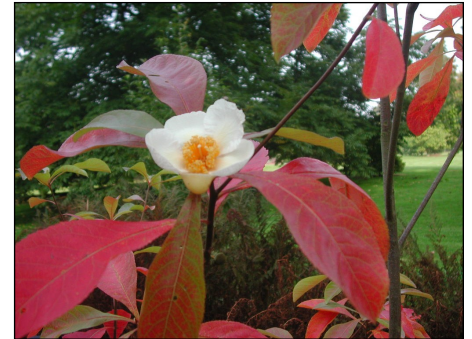
Flowers and leaves in autumn. CC BY-SA 3.0

Reference: Bernheim Arboretum and Research Forest, U.S. Forest Service, www.Arboretum.Harvard.edu