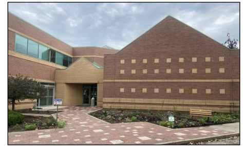
New Building Where Plantings Are Being Placed.