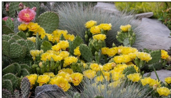
Opuntia in Cactus Garden.