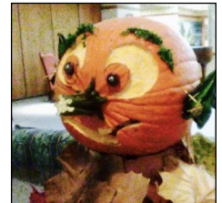
Mythical celeb of yore.

From a lowly patch to the world of celebs, make your Jack-O-Lantern proud. Enter your creation in the Jack-O-Lantern Showcase to display during the run up to Halloween, October 28–31. For recognition and prizes, why not share your creation for all to see! ~Dan Reiber