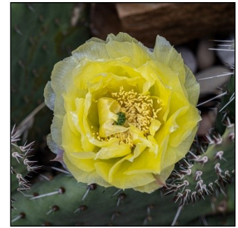
Closeup of Opuntia Flower.