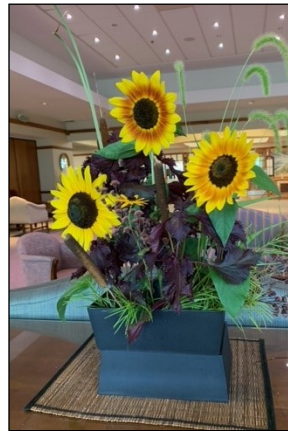
Sunflowers in Heiser Lounge