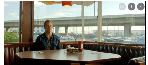
Solo Diners: Come fill our table!

Sign-up sheet is posted by the open mailboxes the week before. The Den holds only 16 diners.