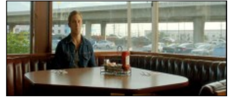
Solo Diners: Come fill our table!