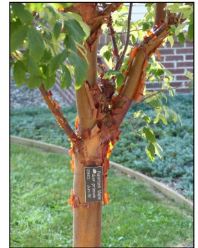
Paperbark Maple Bark.

Notice its interesting bark, which gives this maple its name. Endangered in China, its native habitat, this tree is fast growing and small in size.