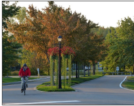
Red Maples Near Center Pond.

Many of our maples here at Kendal are red maples. There is a whole row of them down the center of the roadway from Center Pond to the three-way stop sign. If we plant more maples, we